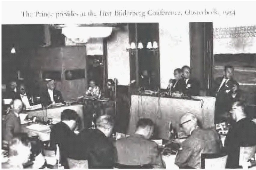
The Prince presides at the First Bilderberg Conference, Oosterbreck, 1954

Their first meeting occurred in Hôtel Bilderberg in the Dutch Oosterbreck between the 29-31 of May 1954, thus the name of the group.