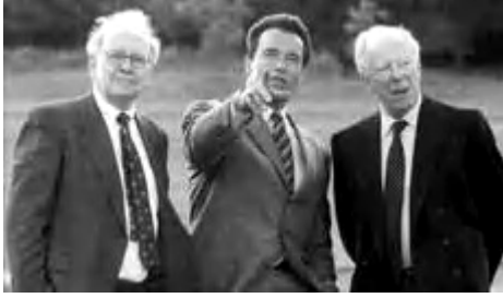
L to R - Warren Buffett, Arnold Schwarzenegger , Lord Jacob Rothschild at Waddesdon Manor.

from behind the scene (yes, they are mostly men, with a few exceptions). They are the "Black Nobility", the Decision Makers, who make up the rules for presidents and governments to follow, and they are often held from public scrutiny, as their action can't stand being scrutinized. Their bloodlines go back thousands and thousands of years, and they are very careful with keeping those bloodlines pure from generation to generation. The only way to do so is by interbreeding.