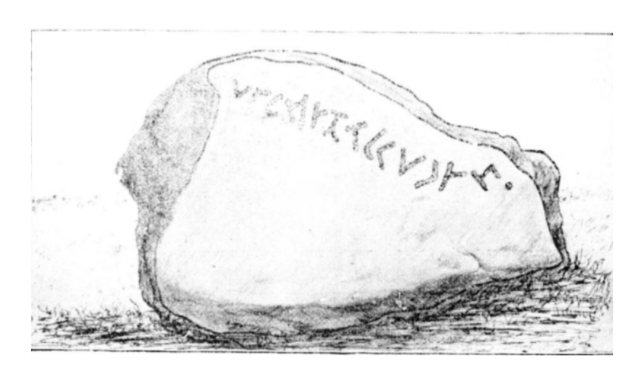
The Fletcher Stone with Runic inscriptions